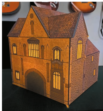
Image 4: Finished example of the 'Make your own Gatehouse' craft activity - downloadable from the website.